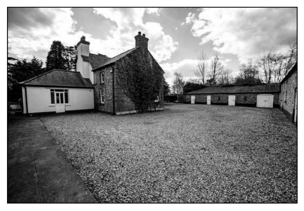
Blakestown House and stables