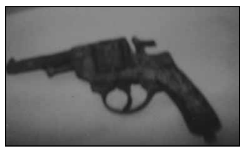
Handgun found near the National School, Leixlip, 1970s