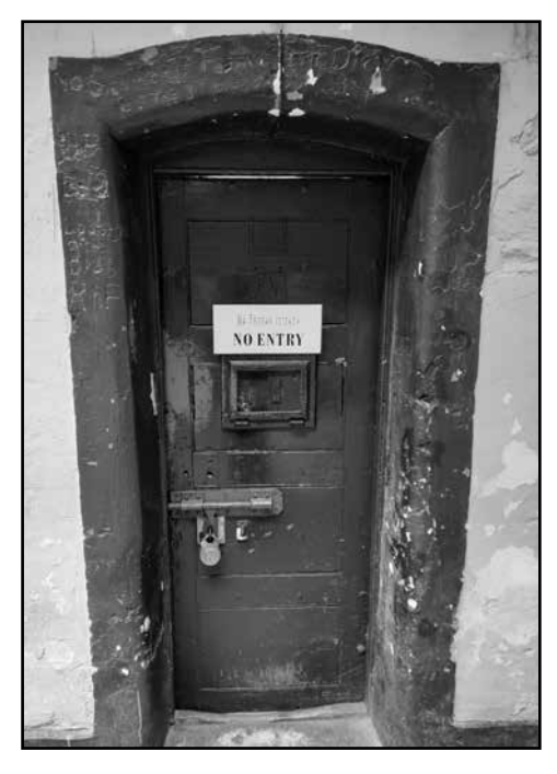
Kilmainham Jail cell with reference to not signing forms over door