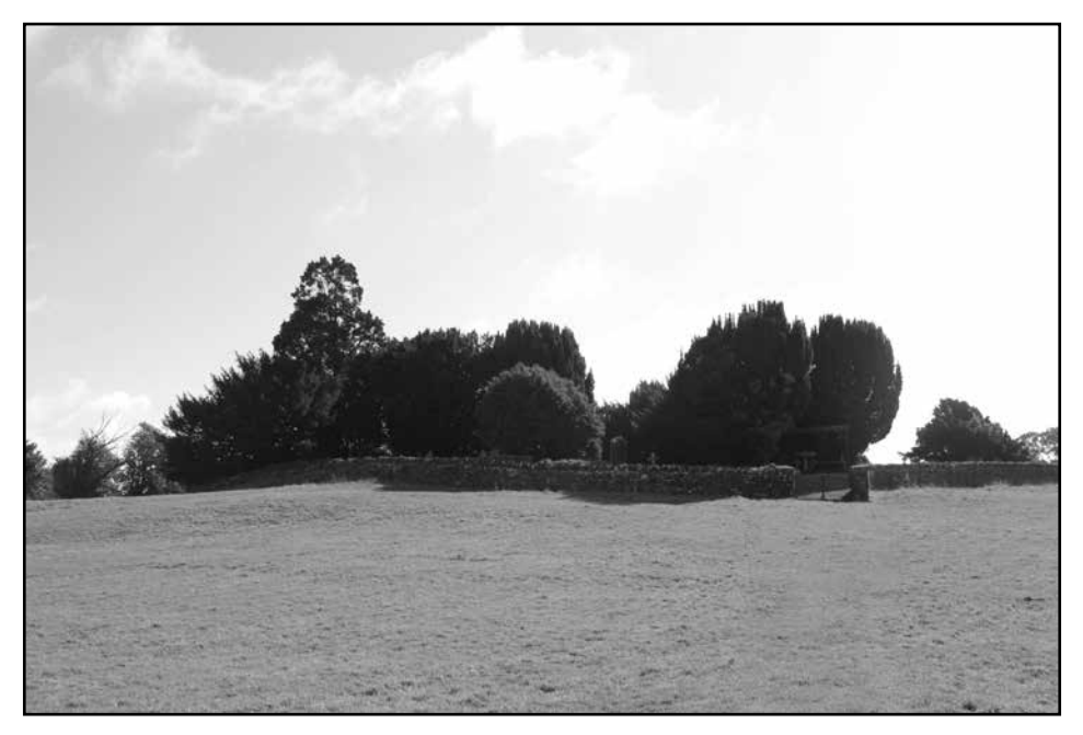
Donaghmore Cemetery in Grangewilliam